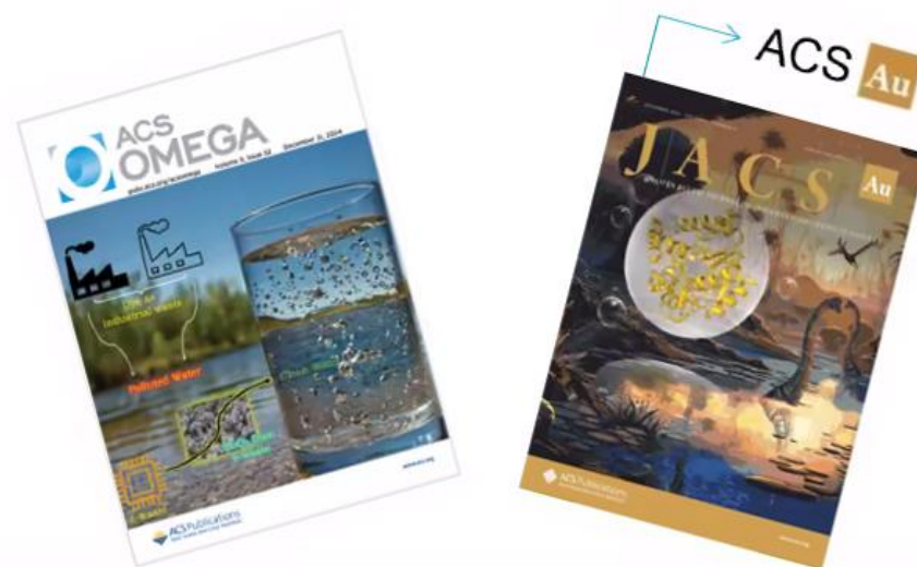
Fully Open Access